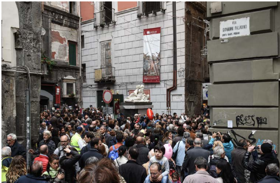
Fig. 5 – Public ceremony for the restoration of Nilo God statue, on November 2014

Besides, the case of Sansevero Chapel Museum and Corpo di Napoli Committee demonstrates the strategic role of community involvement together with the network of key actors to trigger socio-economic and physical improvements in degraded area.