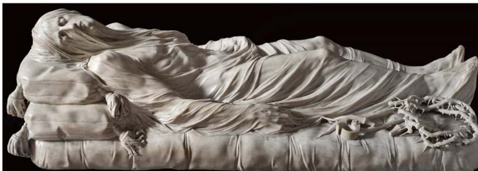
Fig. 3 – The Veiled Christ sculpture