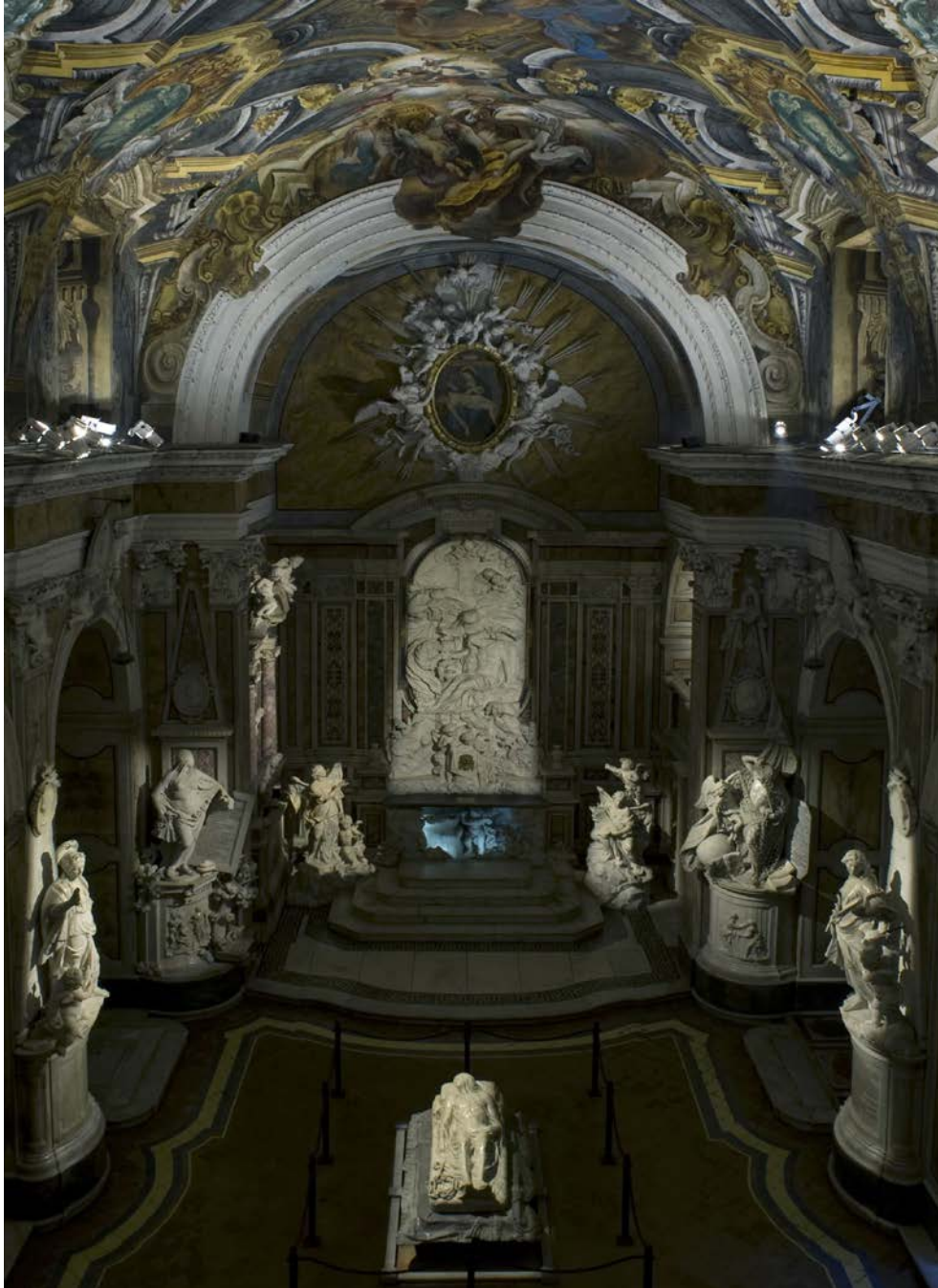
Fig. 1 – The Sansevero Chapel