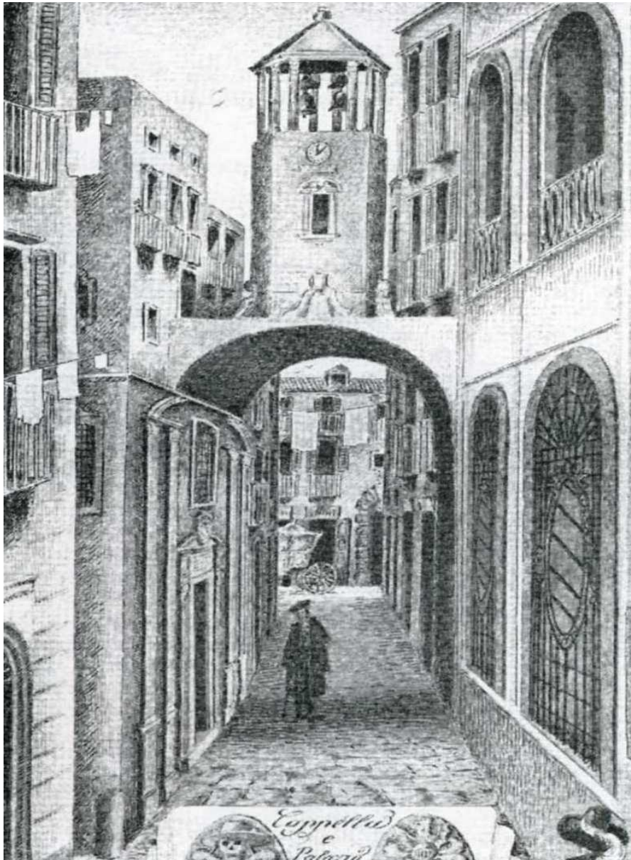
Fig. 2 – Drawing of carillon on the overpass

“places closed”, inaccessible and often relate to a state of neglect and decay. A damage for the culture and for the various tourist aspects.