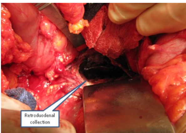
Figure 2. Retroduodenal collection of infected fluid explored three days after type II perforation.

going within the layer of duodenal wall as in pneumatosis cystoides or outside the lumen [4, 5, 8, 11, 13]. This post procedural retroperitoneal air is a common benign finding after endoscopic sphincterotomy and had no predictive value in identifying patients who requires intervention [4, 7, 8, 9, 10, 11, 12, 13]. This was supported by the finding of 13 to 29% incidence of inconsequential retroperitoneal air in several prospective studies [17, 18]. Sphincterotomy induced and guidewire induced perforation constitute the majority (up to 80%) and rarely need intervention [1, 2, 3, 4, 7, 10, 13]. The less often occurring lateral duodenal wall perforation is likely to be associated in patients with altered gastrointestinal anatomy undergoing ERCP. The presence of prior pancreaticoduodenectomy, Billroth II gastrectomy or situs inversus or duodenal diverticulum increases the difficulty of navigating the side viewing endoscope through an atypical path with changed points of fixation [18, 19, 20]. These patients are at increased risk of traumatic injury particularly from bowing of the endoscope. Techniques have been