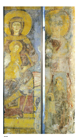
Figure 4. Virgin and Child with St. Clement and a female donor, Baptistery of Old S. Clemente, Rome.