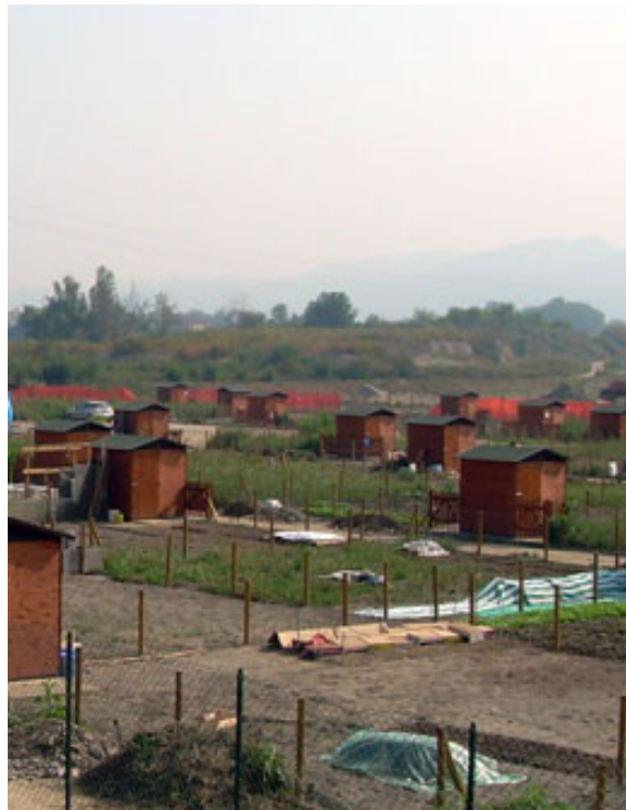
Fig. 2 The latter an example of TOCC project related to urban hortus